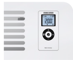
Smart Control Unit