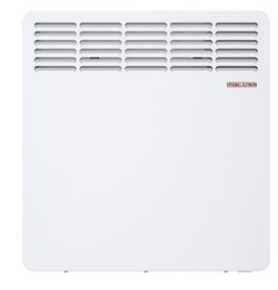
CNS Trend M