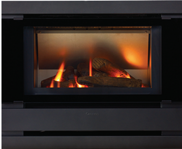
Cannon Elwood Inbuilt Power Flue