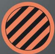
NICKEL PLATED GRILL