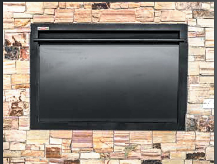
Pictured: Jetmaster built in BBQ & outdoor fire with closed door