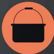
CAST IRON STEWING POT HOOK