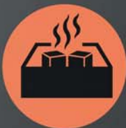
CHARCOAL STARTER TRAY