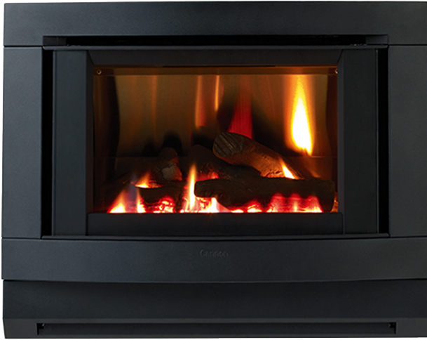
Cannon Cremorne Inbuilt Power Flue